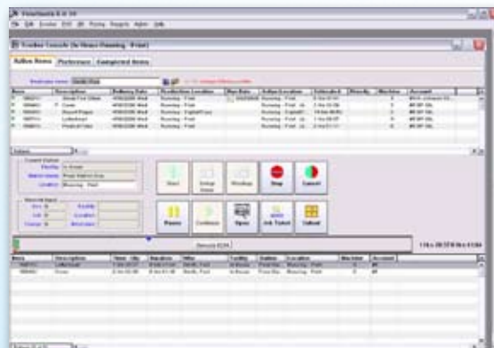
PrintSmith utilizes a familiar and powerful user interface that runs on both Windows® and Macintosh®.

PrintSmith generates customer statements with flexible messaging that you can tailor to each customer. Payment history, special terms, notes on overdue accounts, sales representative names and contact information are all quick and easy to include with PrintSmith. The system produces statement summaries for your accounting staff too, enabling them to do their jobs more accurately and efficiently.