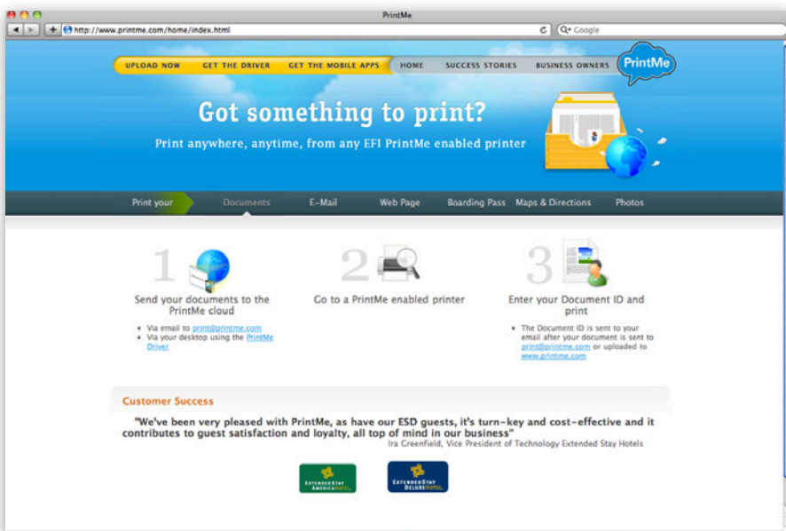
The PrintMe.com website for easy document upload.

More than ever, mobile professionals need to print when they're on the road. And while the businesses have kept pace with customers' growing needs through providing Internet access and sophisticated business centers, there's still one major source of frustration: printing.